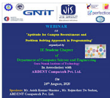
Banner 24th August.jpg 297K